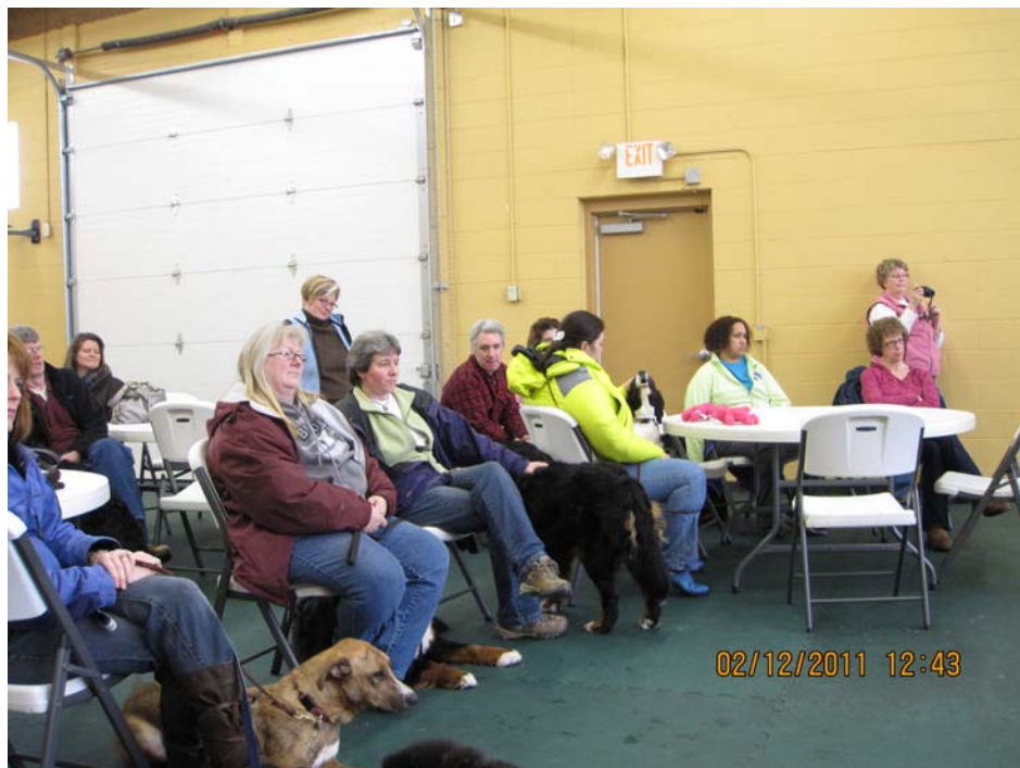
February 12 club meeting.