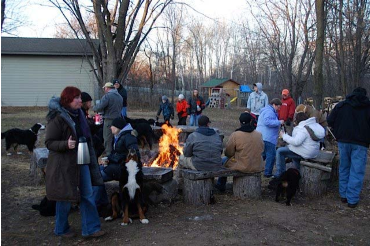
Bonfire at Winterfest