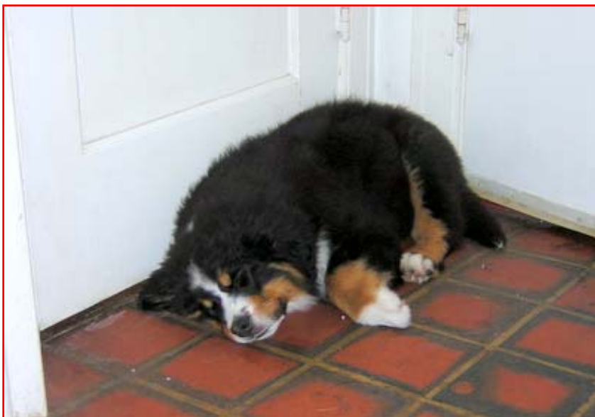
The flame went out on Blaze before the party was over.