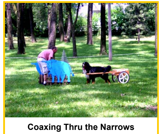
Coaxing Thru the Narrows