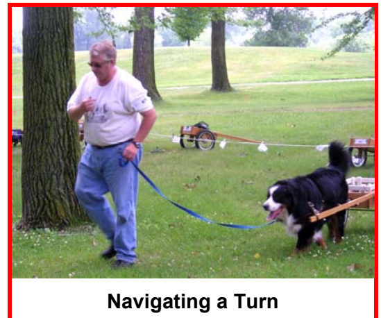
Navigating a Turn